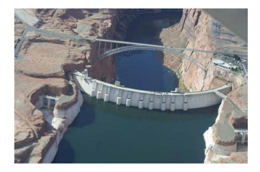
Figure 2: The Maximum Power Output of Hoover Dam Is 2.08 Gigawatts

Sometimes, work is done quickly and at other times the work is done rather slowly. If more power is available, the same amount of work can be performed more quickly. Also, let's look at an example of power as the rate that energy is transferred. The rate at which a light bulb transforms electrical energy into heat and light is measured in watts—the more wattage, the more power, or equivalently the more electrical energy is used per unit time.